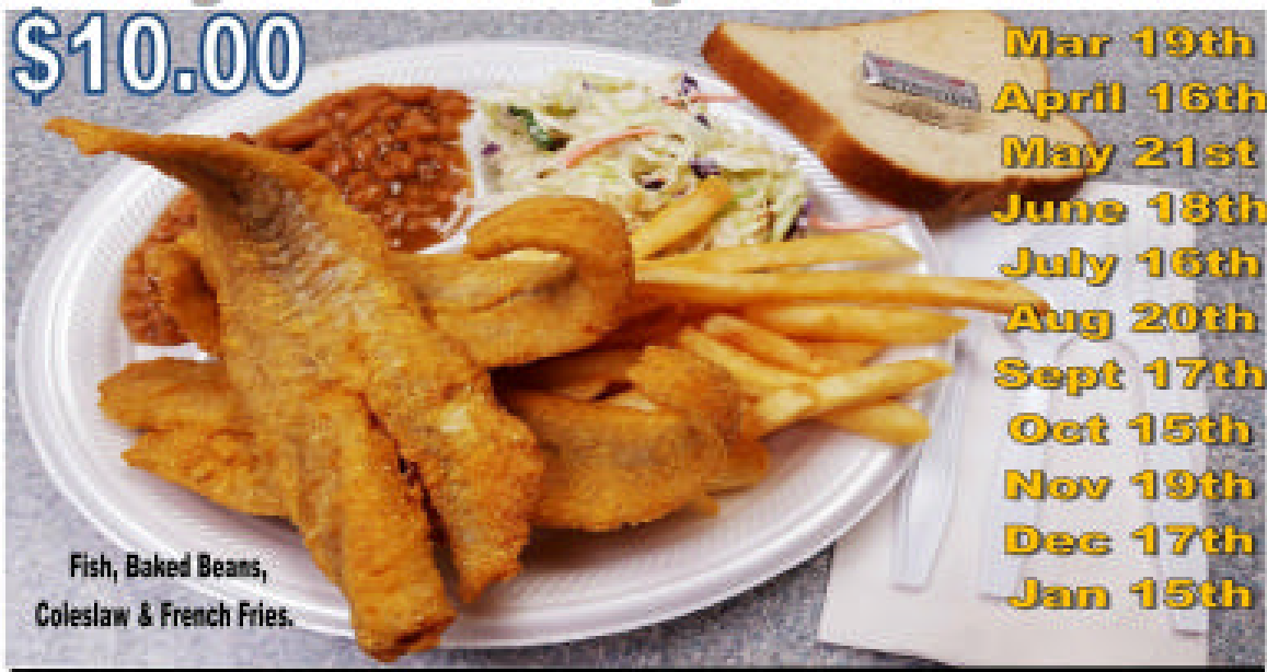
Fish, Baked Beans, Coleslaw & French Fries.

Mar 19th April 16th May 21st June 18th July 16th Aug 20th Sept 17th Oct 15th Nov 19th Dec 17th Jan 15th