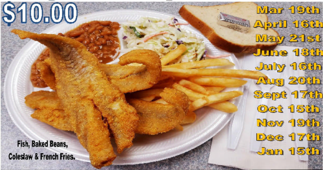
Fish, Baked Beans, Coleslaw & French Fries.

Mar 19th April 16th May 21st June 18th July 16th Aug 20th Sept 17th Oct 15th Nov 19th Dec 17th Jan 15th